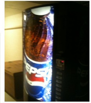
Vending machines running 24/7 even during breaks