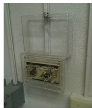
Broken thermostat set for hearing & cooling at 72 degrees