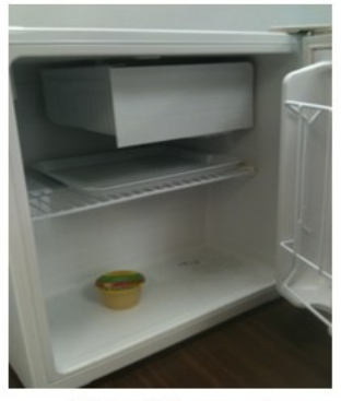
Mini-Fridge on for the summer cooling container of applesauce