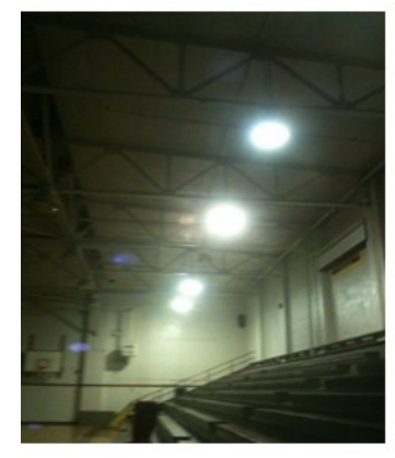
Gym lights on 24/7 even during breaks