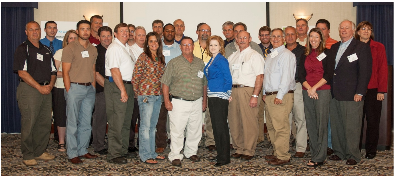
School Energy Managers—October 2013