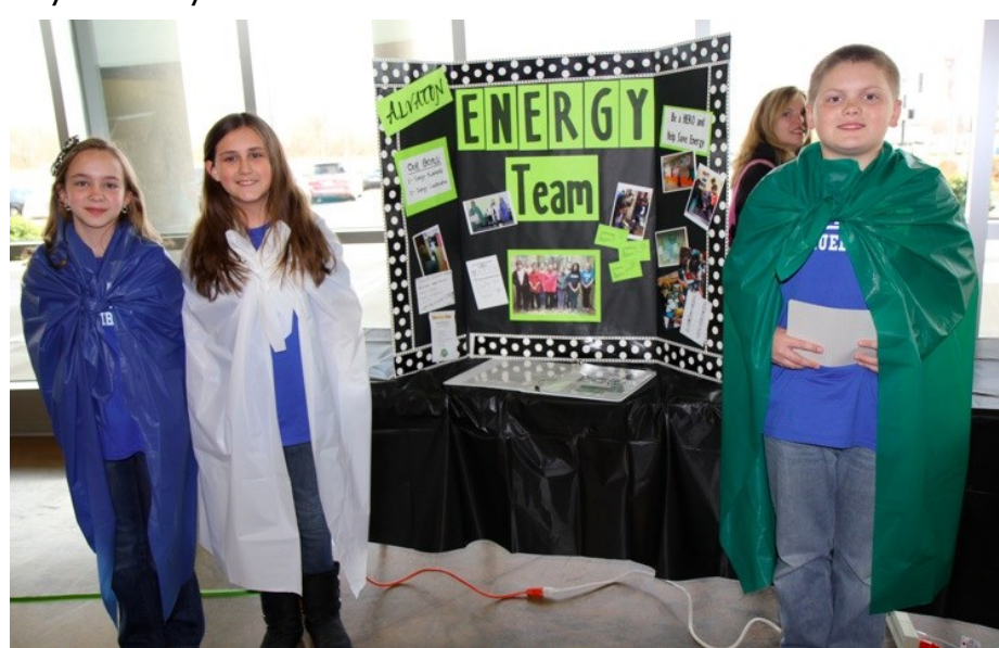
The Alvaton Elementary Energy Team works throughout the year to identify and eliminate "vampire" loads in their school.