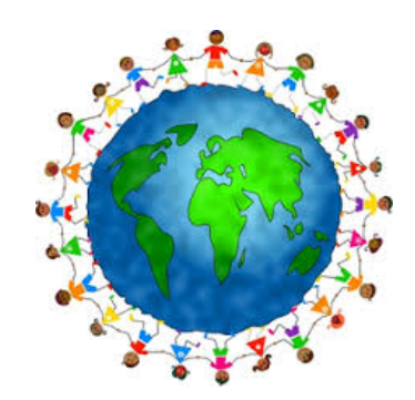
SAVE THE DATE! Kentucky PTA Convention

Looking for the KY PTA Leaders' Notebook? It's on our website!